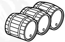
EX-RUBY PORT CASKS