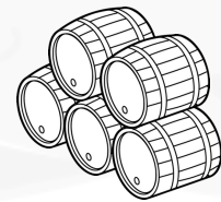
GARRYANA OAK CASKS